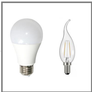
All kind of Bulbs